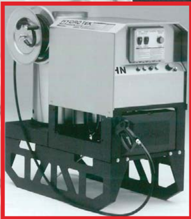
HN Pro Line Series shown w/ hose reel option