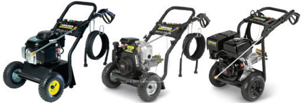
Model HD 2.3/26 CV: 21"L x 23"W x 31"H