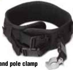
Belt and pole clamp

Extension Wand Control Kit below (Part No. 8.749-848.0) fits this lance.