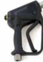
Model RL84 "Big Black Gun"