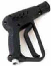
Iride Kew Style