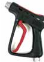
ST-3002 Stainless Steel Gun